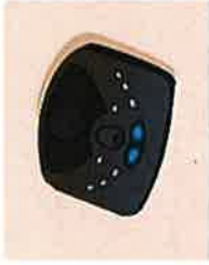
DI for Drummer's SOUND MODULE