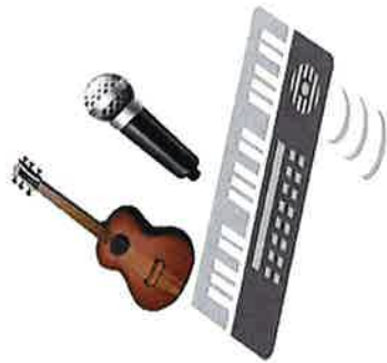
(2) DI's for ACOUSTIC GUITAR & KEYBOARD and VOCAL MIC