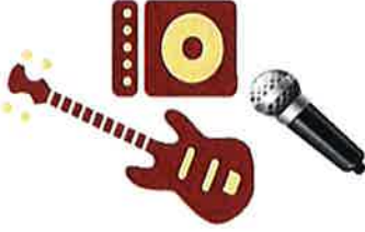
BASS AMP & VOCAL MIC