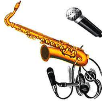
SAX MIC and VOCAL MIC