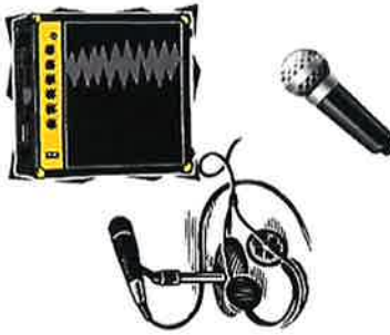
GUITAR 1 MIC AMP and VOCAL MIC