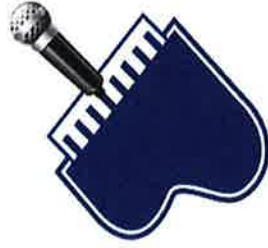
STEREO DI for ELECTRIC GRAND and LEAD VOCAL MIC